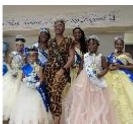
Fontana Kiwanis contestant wins a place on the Miss Black Awareness court.