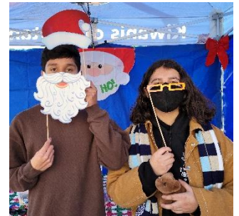
Key Club members from Kaiser High School helped all day long in the club's Festival of Winter game booth.