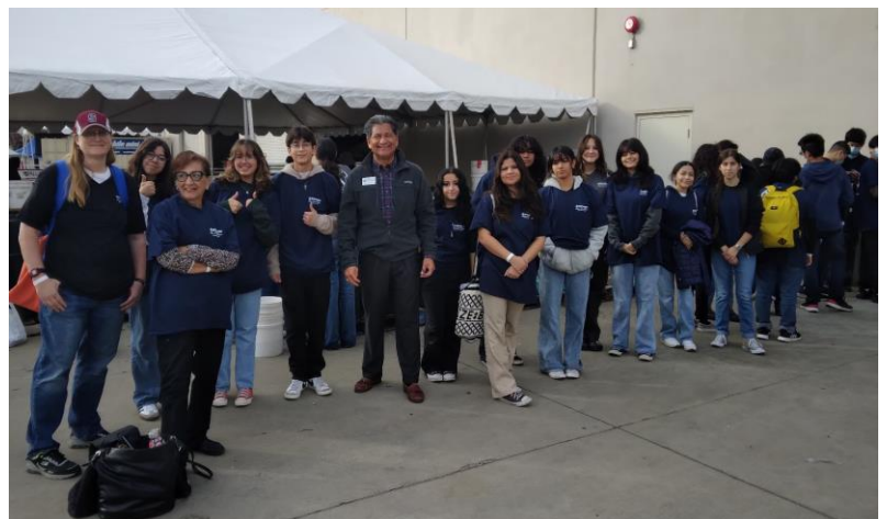
Fontana members and Key Clubbers came out in droves to help decorate multiple Rose Parade floats in Irwindale including the Kiwanis International's float.

THANK YOU VOLUNTEERS FOR SUPPORTING THIS FANTASTIC EVENT!