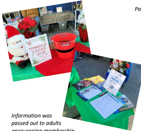
Information was passed out to adults encouraging membership.

The club's 1 st Annual Tombola game booth gave out over 750 fun prizes and was a big hit with both children and adults! The game booth was to benefit youth programs.