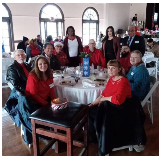
Kiwanis Club of Fontana members attended the United Service Club Christmas Toy Drive luncheon on December 12 th .

Each year Fontana service organizations gather together to bring happiness to boys and girls. Each attendee brought two unwrapped gifts, which were then turned over to the Fontana Police Officers Association.